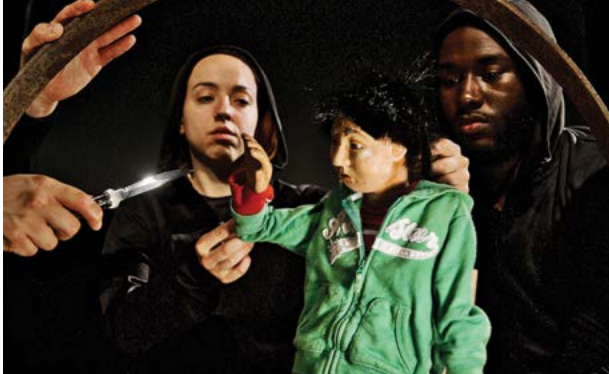
Sandglass Theater, of Putney, will tour with New England States Touring and National Theater Project support; photo by Kiqe Bosch.