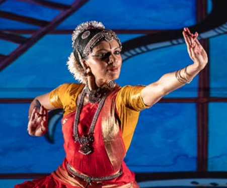
The Mahaney Center for the Arts will present Expeditions-supported Ragamala Dance Company