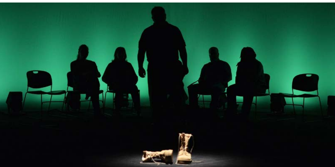
Chandler Center for the Arts will present The Telling Project with Expeditions support; photo by Luke Heikkila.

The New England Foundation for the Arts (NEFA) invests in the arts to enrich communities in New England and beyond. NEFA serves as a regional partner for the National Endowment for the Arts, New England's state arts agencies, and private foundations.