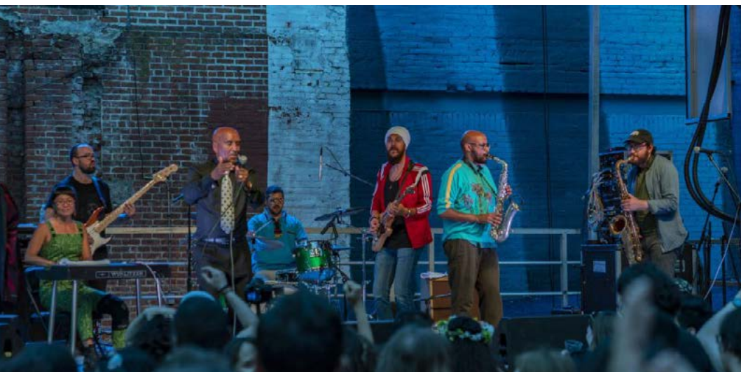
Firstworks presented New England States Touring (NEST)-supported Debo Band; photo by Koki.