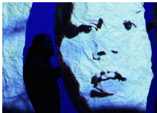
Everett Company, of Providence, toured the country with a National Dance Project Production grant