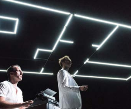
Firstworks presented Early Morning Opera with Expeditions support; photo courtesy of Early Morning Opera.