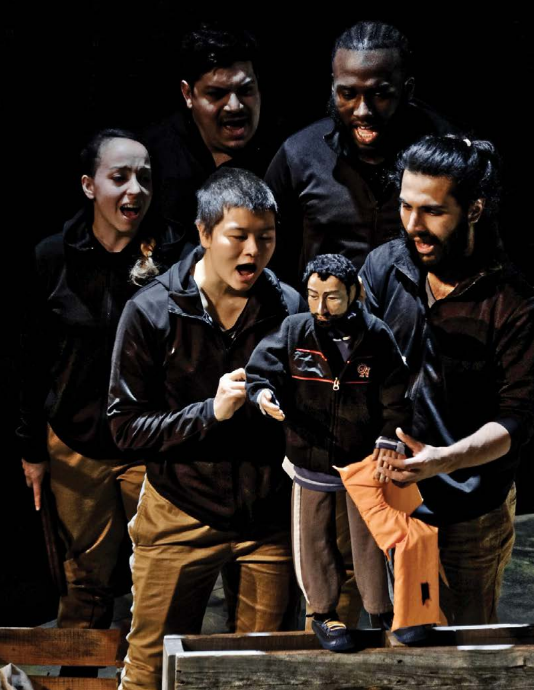
With a National Theater Project Presentation Grant, Redfern Arts Center at Keene State College presented Sandglass Theater, of Putney, VT.