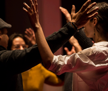
600 HIGHWAYMEN performed at Portland Ovation, with National Theater Project support; photo by Maria Baranova.