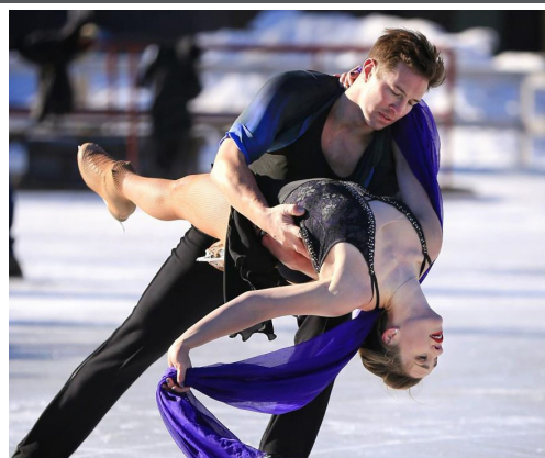
Ice Dance International, of Kittery, toured New England with NEST support; photo by Joanna Raptis.