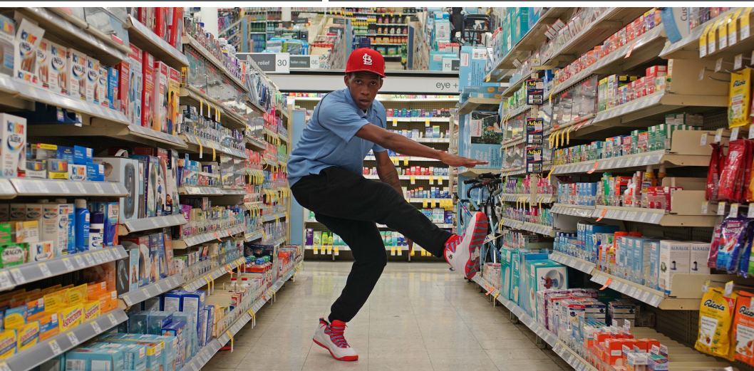
With Expeditions Tour Planning support, Bates Dance Festival worked with The Era Footwork Crew of Chicago; photo courtesy of The Era Footwork Crew.