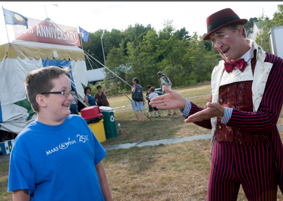
With New England States Touring support, Maine Coast Waldorf School presented Circus Smirkus; photo by Tricia Toms.