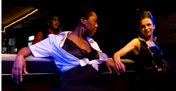
The Theater Offensive presented LAST CALL at Jacques Cabaret with a National Theater Project Presentation grant; courtesy of LAST CALL.