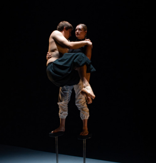
Jacob's Pillow presented Circa with Expeditions support