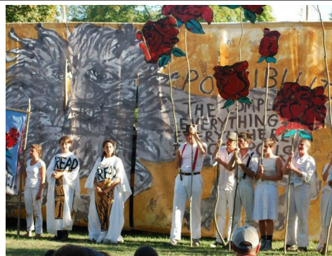
Bread & Roses Heritage Committee, of Lawrence, presented Bread and Pupper Theater with NEST support; courtesy of Bread & Roses.