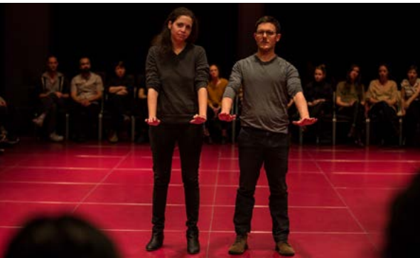
With National Theater Project support, American Repertory Theater presented 600 HIGHWAYMEN.