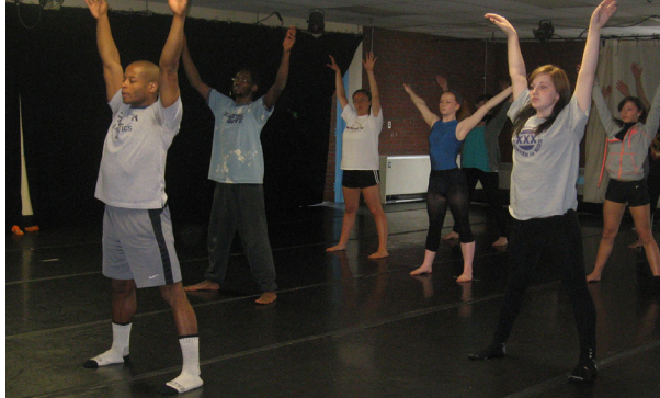
With New England States Touring (NEST) support, MOMIX, of Washington, performed in Portland, ME; photo courtesy Portland Ovations.