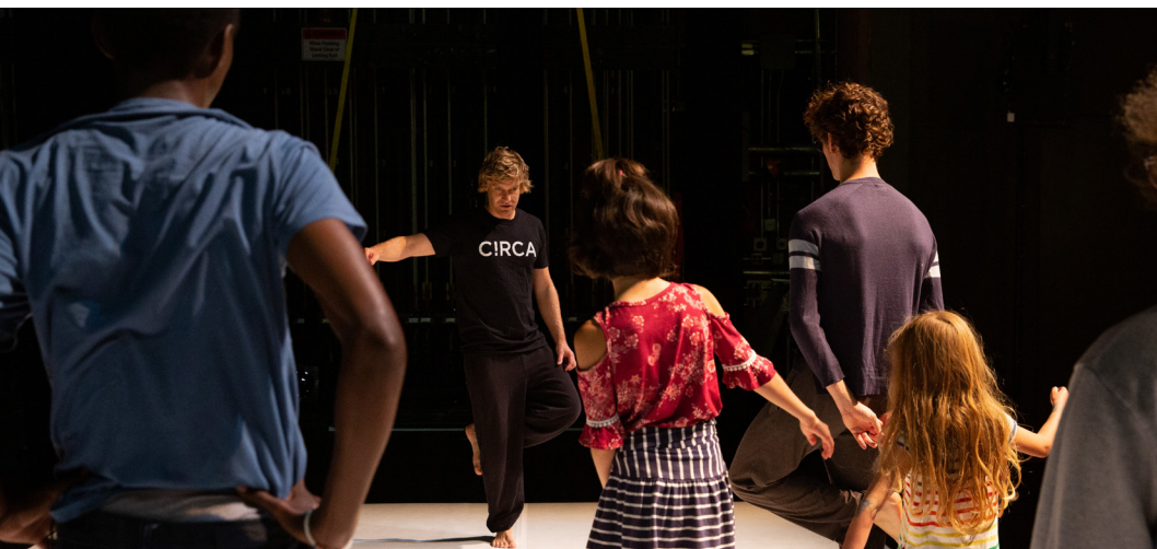
With Expeditions Touring support, International Festival of Arts & Ideas presented Circa