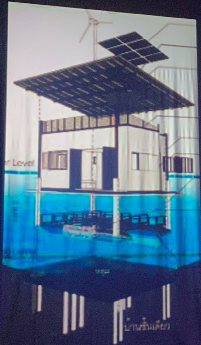
New England States Touring-supported Ko Theatre Works presents Serious Play Theatre Ensemble