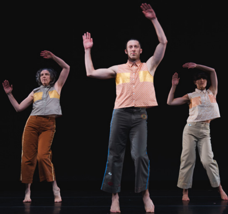
Choreography by Heidi Henderson at the New England Now Dance Platform, photo by Olivia Moon Photography

Today, NEFA's programs are regional, national, and international in scope, supporting artists and communities through grants and other resources including workshops, convenings, research, and online tools.