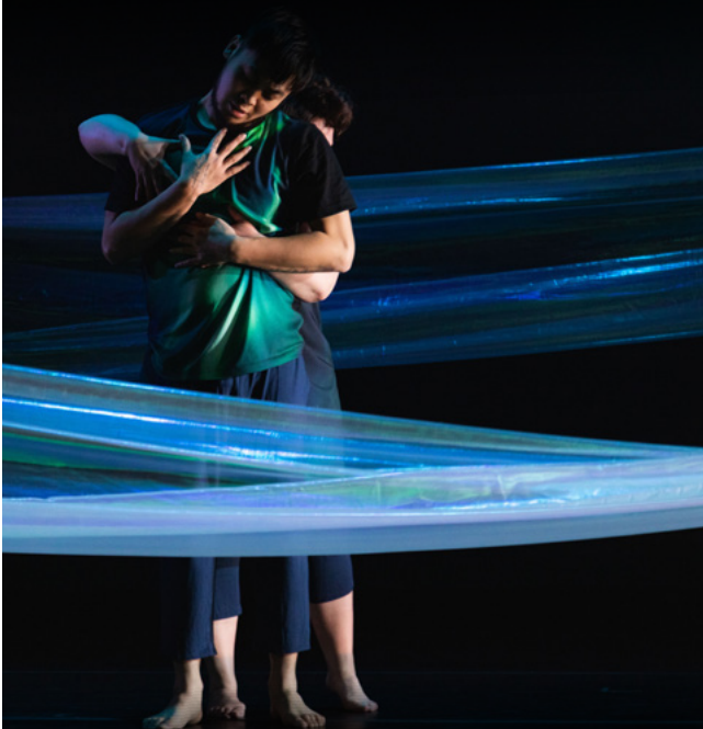
Choreography by Sarah Duclos at the New England Now Dance Platform

To make a gift or to learn more about NEFA’s work, please visit us at nefa.org/donate , or call our development department at 617-865-1846.