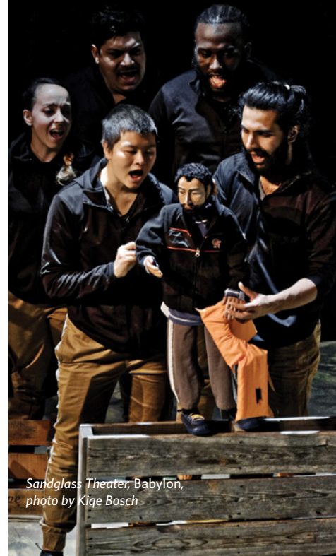
Sandglass Theater, Babylon, photo by Kiqe Bosch

To make a gift or to learn more about NEFA's work, please visit us at nefa.org/donate , or call Sharon Timmel at 617.951.0010 x511.