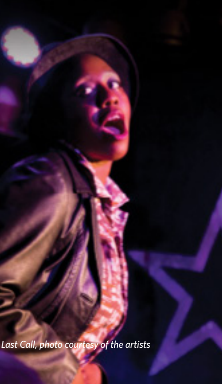
Last Call

To make a gift or to learn more about NEFA's work, please visit us at nefa.org/donate , or call Sharon Timmel at 617.951.0010 x511.