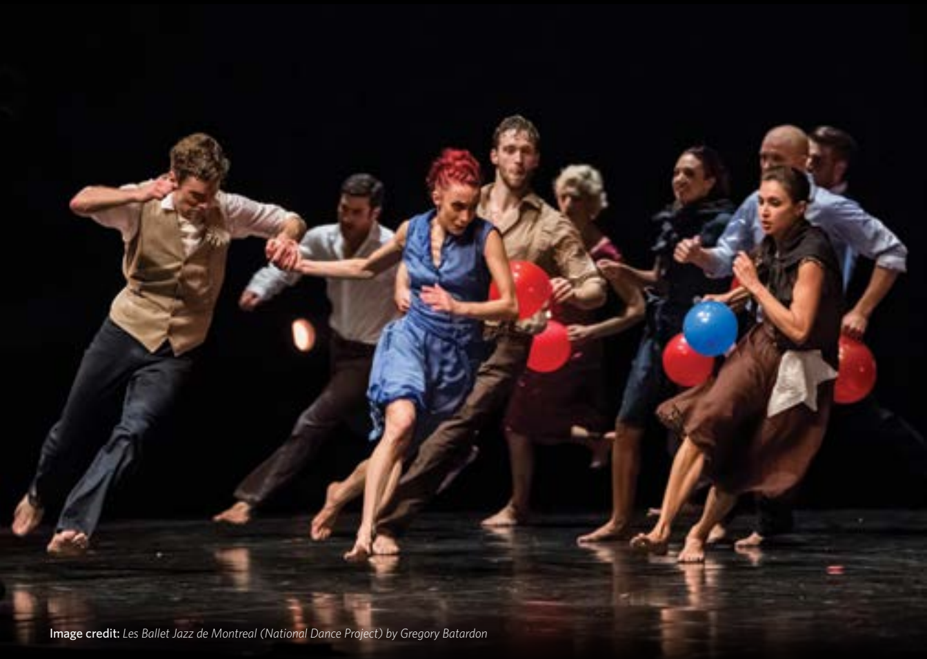
Les Ballet Jazz de Montreal (National Dance Project)

NEFA supports artists across many forms of expression and many geographies, connecting collaborators and communities, fueling creative exchange and public discourse, and strengthening the creative economy. Through grants, convenings, online tools, and research, and through pioneering partnerships, NEFA continues a nearly 40-year history of supporting the arts.