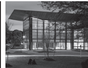
'62 Center for Theatre and Dance at Williams College,