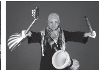
ARABIQA by Karim Nagi

www.creativeground.org creativeground@nefa.org