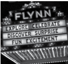
Flynn Center for the Performing Arts

Does your profile need a check-up? Not sure how to make the most of CreativeGround? Visit the "CreativeGround Clinic" for a prescription of ways to boost your existing CreativeGround profile or create a new one.