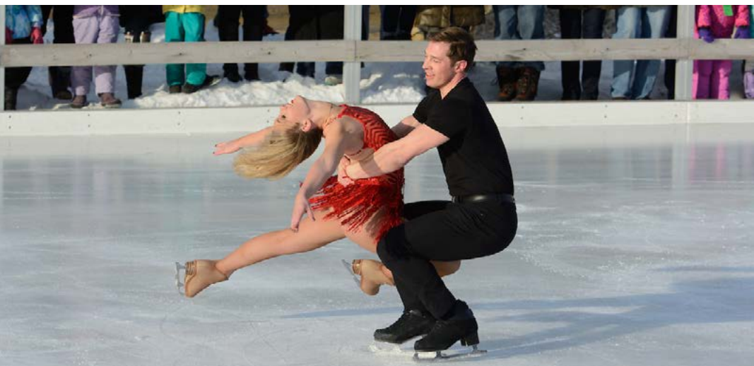
Strawberry Banke Museum presented Ice Dance International with New England States Touring support; photo by David J. Murray, Clear Eye Photography.