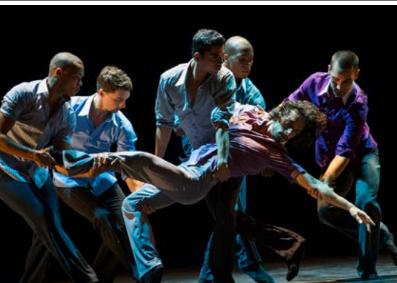
Pinkerton Academy will present Expeditions-supported Ballet Hispanico; photo by Paula Lobo.