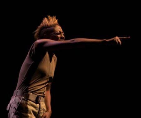
Redfern Arts Center at Keene State College will present Expeditions-supported The Telling Project; photo by Dragon's Eye Studios.