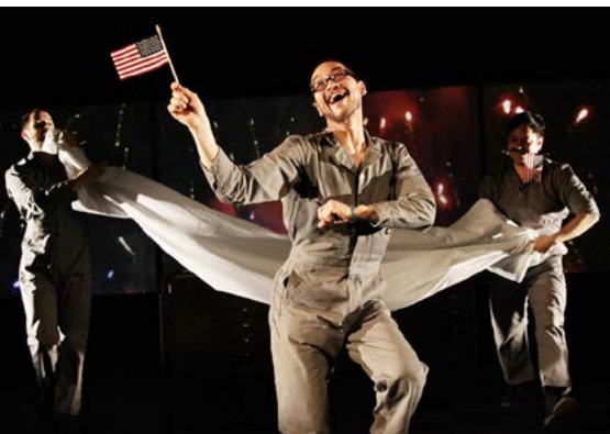
Bates Dance Festival traveled to see Ping Chong + Company with National Theater Project Presenter Travel funds; photo by Theo Cote.