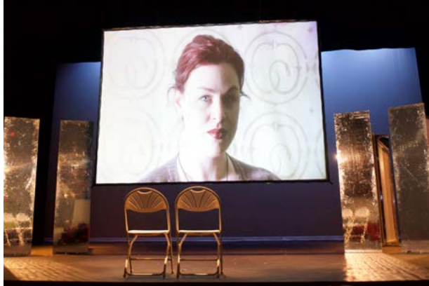
a canary torsi performed at Bates Dance Festival in Lewiston, with Expeditions support; photo by Jim Coleman.