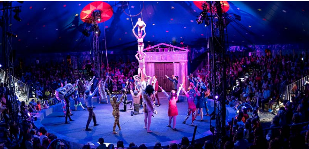
Maine Coast Waldorf School presented New England States Touring supported Circus Smirkus.