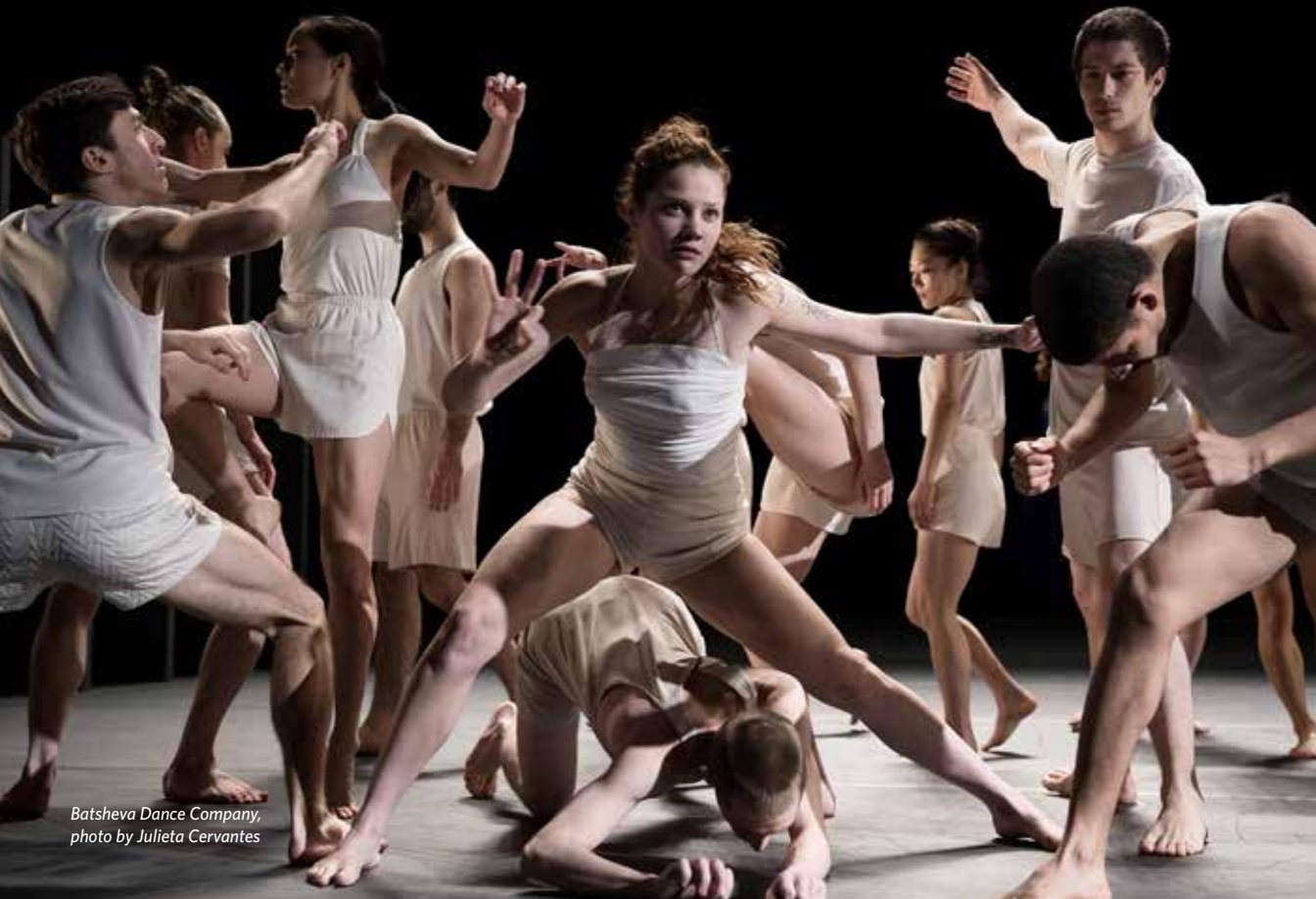
Batsheva Dance Company

Each program and project that is brought to life at NEFA builds a stronger and more dynamic infrastructure for the arts. Through grants, convenings, online tools, creative economy research, and pioneering partnerships, NEFA continues an over 40-year history of supporting the arts.