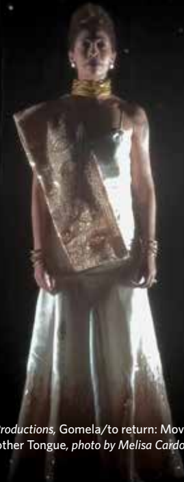
Junebug Productions, Gomela/to return: Movement of our Mother Tongue